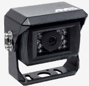
AMS Camera *

This adaptor cable enables the use of the DATATRONIC3 monitor for Massey Ferguson tractors with an AMS camera.