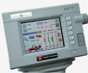
Monitor DATATRONIC 3