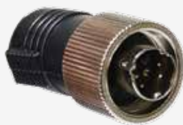
MF TRACTOR 3