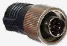
MF TRACTOR 3