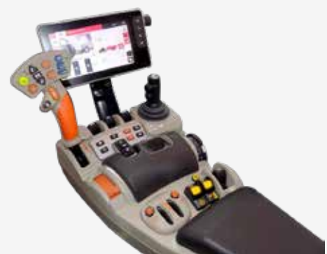
Armrest DATATRONIC 5

* Camera and original monitor are not included. All the AMS cameras are compatible with this adaptor cable