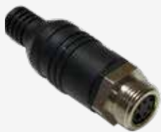
MK-367 cable located at the armrest exit.