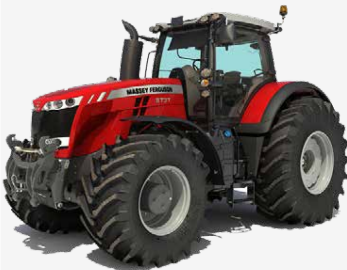
Massey Ferguson serie 8700 (2017)