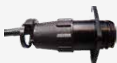
Adaptor cable NHL COMB3 MC