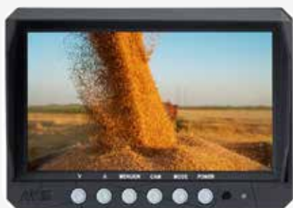
AMS Monitor M7 / MS7 / M9 / MS9