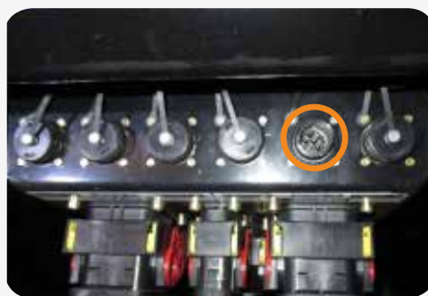
(C2 7 male pin) Unplug the fifth connector : the video cable of the original camera in the machine

* Camera, monitor and extension cable are not included. Original camera compatible with all the AMS monitors