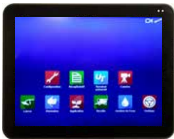
Your original monitor INCOMMAND 1200*