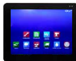
Your original monitor INCOMMAND 800*