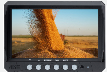
AMS Monitor M7 / MS7 / M9 / MS9 / M7WP*