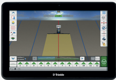
TMX - 2050 (XCN - 2050) - 1 video input TRIMB2 and 1 video input TRIMB1