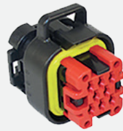
Adaptor cable TRIMB2