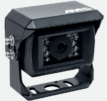
AMS camera *

The adaptor cable VT-TRACTOR1 allows to equip the Terminal Smart Touch (Valtra machines).