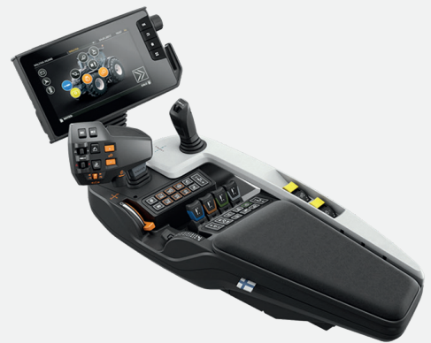
Armrest Smart Touch

→ N, T, and S series + G series for VERSU models only