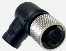
VT TRACTOR 1 (2m)