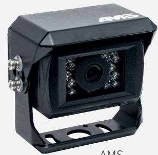
AMS camera* (x3)