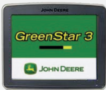
GREENSTAR 2630 1 video input