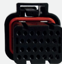
Adaptor cable JD COMBINE

* Camera and original monitor are not included. All the AMS cameras are compatible with this adaptor cable (except wireless camera)