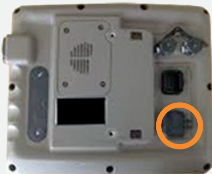
GREENSTAR 2630 1 video input