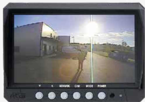
Facing the sun