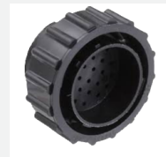
Adaptor cable AGL INTEGRA

* Camera and original monitor are not included. All the AMS cameras are compatible with this adaptor cable (except wireless camera)