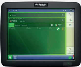
AG LEADER INTEGRA or VERSA 1 video input